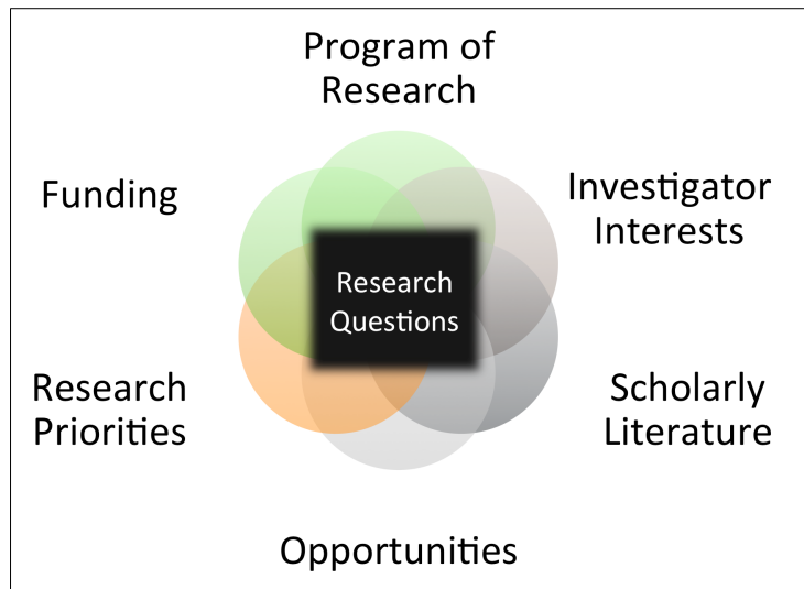
Figure 26.3: Selected factors influencing the choice of research question